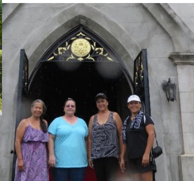
Top left: HCCW 2015 Bottom left HCCW 2016 Above HCCW 2017 Mahalo nūnui kākou... Eō