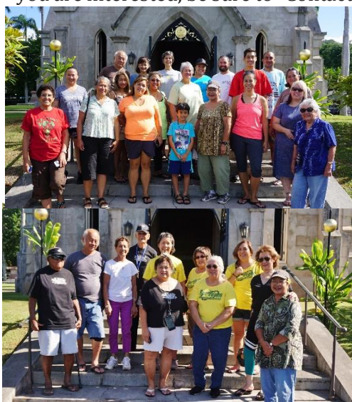
Ke Akua e Ho'opōmaika'i kākou!