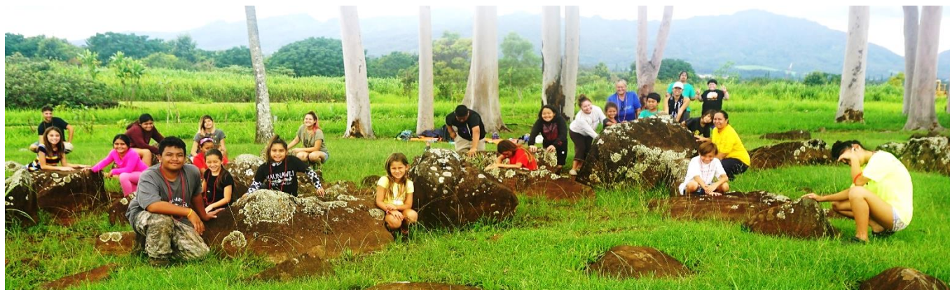
Mahalo nūnui Ehuola ‘Ohana Health Kalihi

10.08.2k19 ... Ehuola ‘Ohana Health Kalihi visited with Kahuiao today. Their Fall Intercession Break plans included ha‘awina , " Mo‘olelo , Mo‘okū‘auhau , and Wahipana ". Kūkaniloko outdoor classroom was in perfect compliance with this program. (20) Keiki , 3 rd to 5 th grade and (6) Makua chaperones enjoyed their lessons for the day. We appreciate your kind donation to be used for the maintenance and care of Kukaniloko Birthstones. Eō